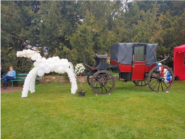
Coronation Coach and "horse"