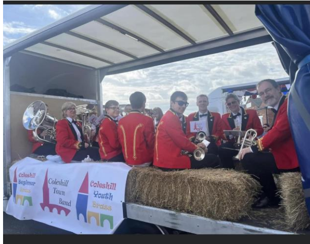
Coleshill Town Band played on the Croft