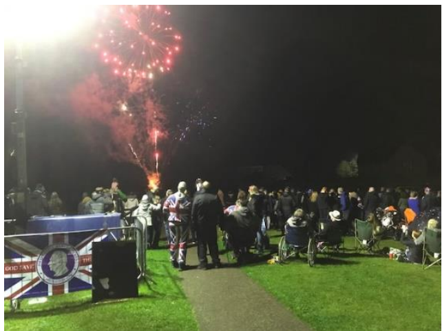
The Croft event ended with a bang (or two)

Above: Coronation Celebrations in May '23