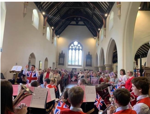
Red, white & blue Coronation Service